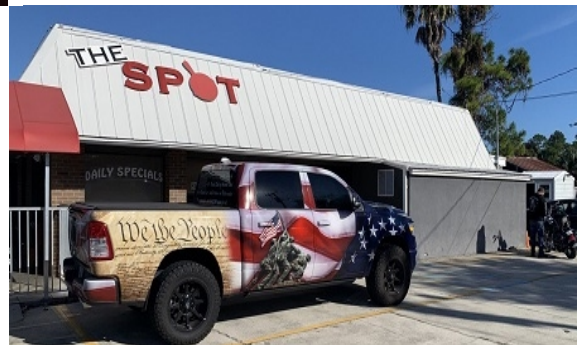
Social Media Image

The conservative elements of the St. Johns County Republican Executive Committee (SJC-REC) held a unity meeting at The Spot, a local restaurant located on Highway US1 North in St. Johns County (SJC) Florida, on October 20, 2022.